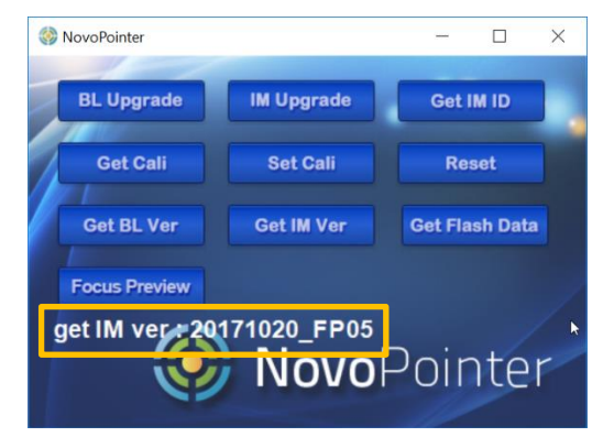
The update is now completed!